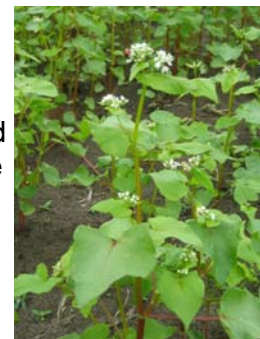
Buckwheat beginning to flower at 4 weeks after planting.

Chase and Huang also tested nonchemical methods to kill the buckwheat crop. These methods included rolling over it with a drum roller, mowing it with a flail mower, lightly tilling it into the ground, and a combination of flail mowing followed by light tillage. More than