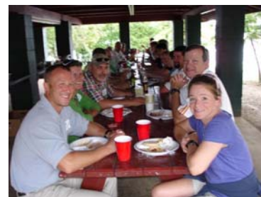
The group discusses their thoughts on the PMSP during a barbecue lunch at the end of the meeting.

The biggest weed problems in nurseries? That depends on the nursery. In field production it is nutsedge – a perennial weed that is not controlled well by most herbicides labeled for use in nurseries and is spread by cultivation. Container nurseries have very different weed populations, with spurge and bittercress being the dominant (and most costly) species. One central theme from growers was a desire to have more cost-effective weed management