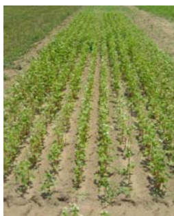
Buckwheat planted at 50 lb/acre on Apr. 10, 2007; photo taken at 4 weeks after planting.

“Even though hot weather in Florida is not appropriate for buckwheat growth and reduces the effectiveness of buckwheat for weed suppression, buckwheat may still play a role in sustainable cropping systems by providing ecosystem services such as nectar sources for beneficial insects, phosphorus, organic matter, and short-term soil cover for neighboring or subsequent crops,” she writes.